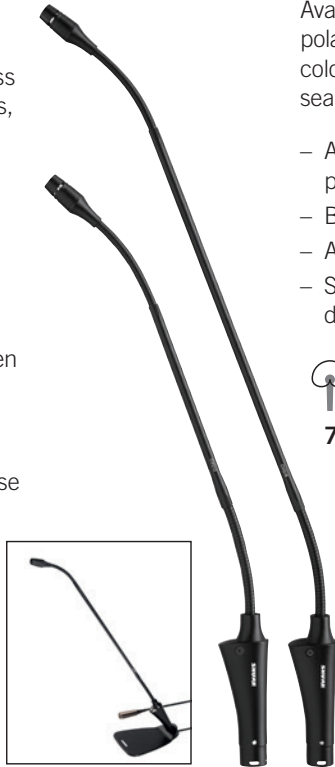
CVGD with Integrated Desktop Base